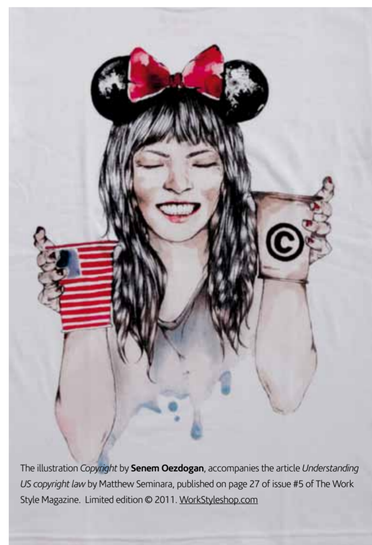
The illustration Copyright by Senem Oezdogan , accompanies the article Understanding US copyright law by Matthew Seminara, published on page 27 of issue #5 of The Work Style Magazine. Limited edition © 2011. WorkStyleshop.com