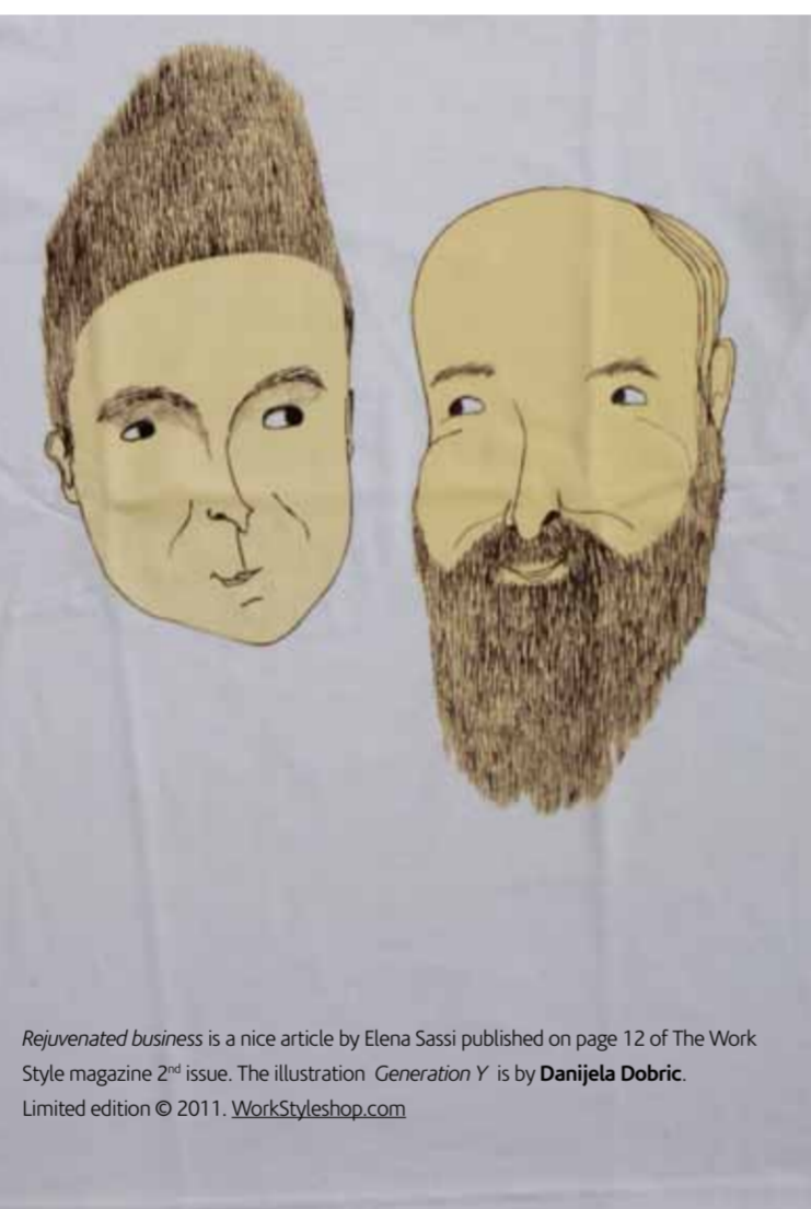
Rejuvenated business is a nice article by Elena Sassi published on page 12 of The Work Style magazine 2 nd issue. The illustration Generation Y is by Danijela Dobric . Limited edition © 2011. WorkStyleshop.com