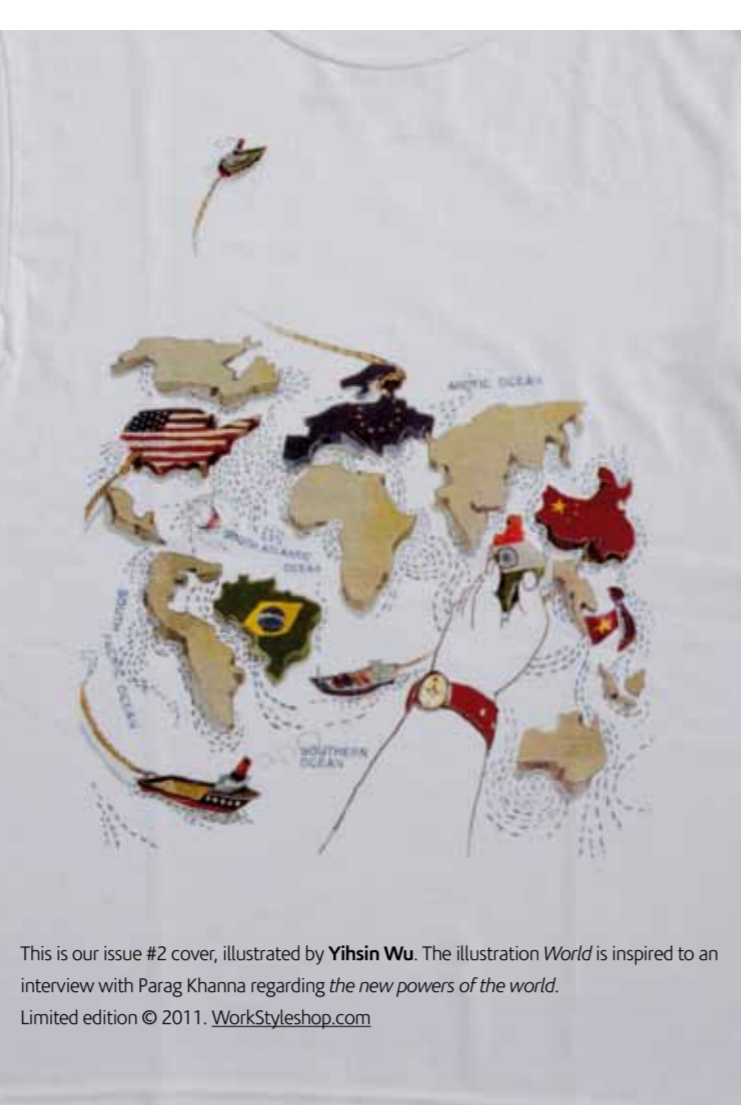
This is our issue #2 cover, illustrated by Yihsin Wu . The illustration World is inspired to an interview with Parag Khanna regarding the new powers of the world . Limited edition © 2011. WorkStyleshop.com