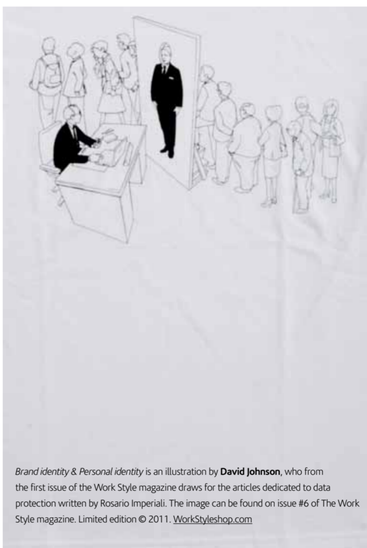
Brand identity & Personal identity is an illustration by David Johnson , who from the first issue of the Work Style magazine draws for the articles dedicated to data protection written by Rosario Imperiali. The image can be found on issue #6 of The Work Style magazine. Limited edition © 2011. WorkStyleshop.com