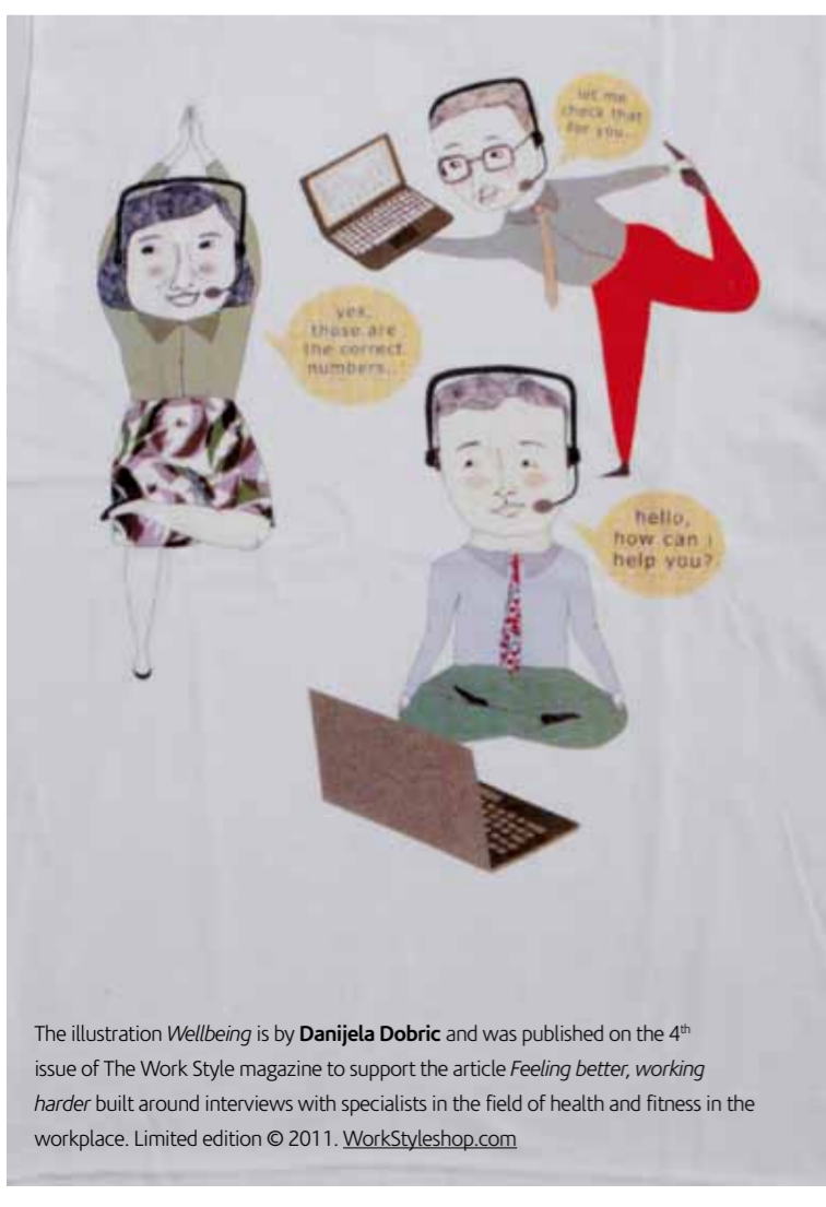
The illustration Wellbeing is by Danijela Dobric and was published on the 4 th issue of The Work Style magazine to support the article Feeling better, working harder built around interviews with specialists in the field of health and fitness in the workplace. Limited edition © 2011. WorkStyleshop.com