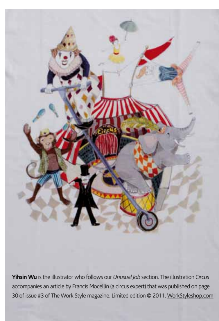
Yihsin Wu is the illustrator who follows our Unusual Job section. The illustration Circus accompanies an article by Francis Moccellini (a circus expert) that was published on page 30 of issue #3 of The Work Style magazine. Limited edition © 2011. WorkStyleshop.com